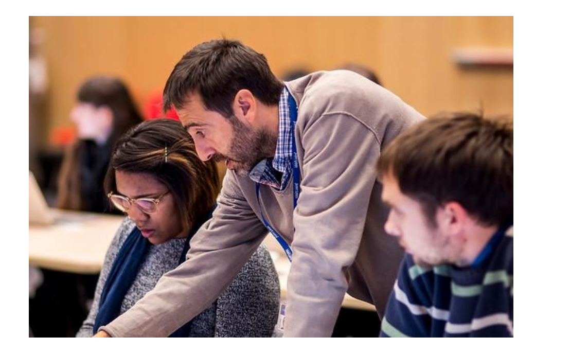
Figure 2. Tutorial prepared by EGO/VIRGO/ET on the follow-up of GW events using Virtual Observatory tools.

The era of gravitational-wave (GW) astronomy began with the detection of binary black hole (BBH) mergers, by the <u>Advanced Laser Interferometer Gravitational-Wave</u> <u>Observatory</u> (LIGO) detectors, during the first of the Advanced Detector Observation Runs. Three detections, <u>GW150914</u>, <u>GW151226</u>, and <u>GW170104</u>, and a lower significance candidate, <u>LVT151012</u>, have been announced so far. The <u>Advanced Virgo detector</u> joined the second observation run on August 1, 2017.