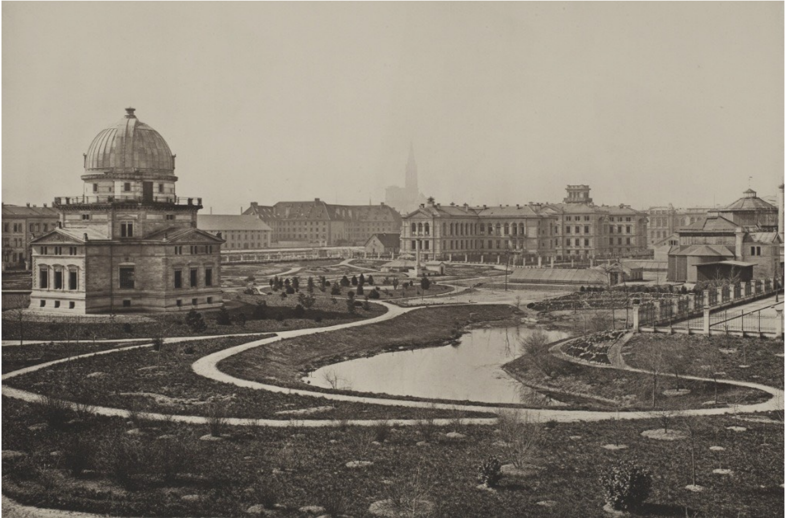
L'observatoire en 1881, côté ville