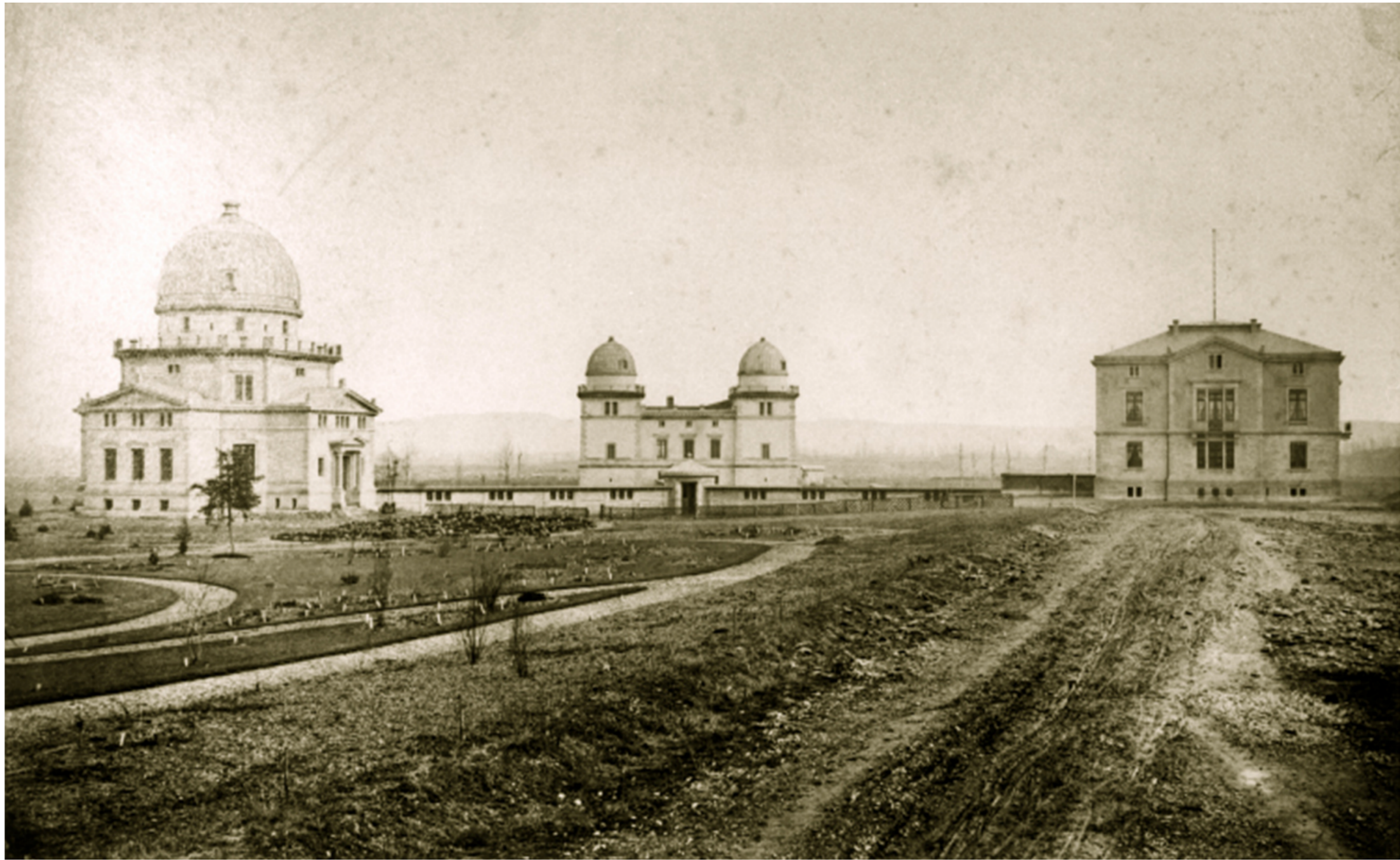
L'observatoire en 1881, côté Forêt Noire